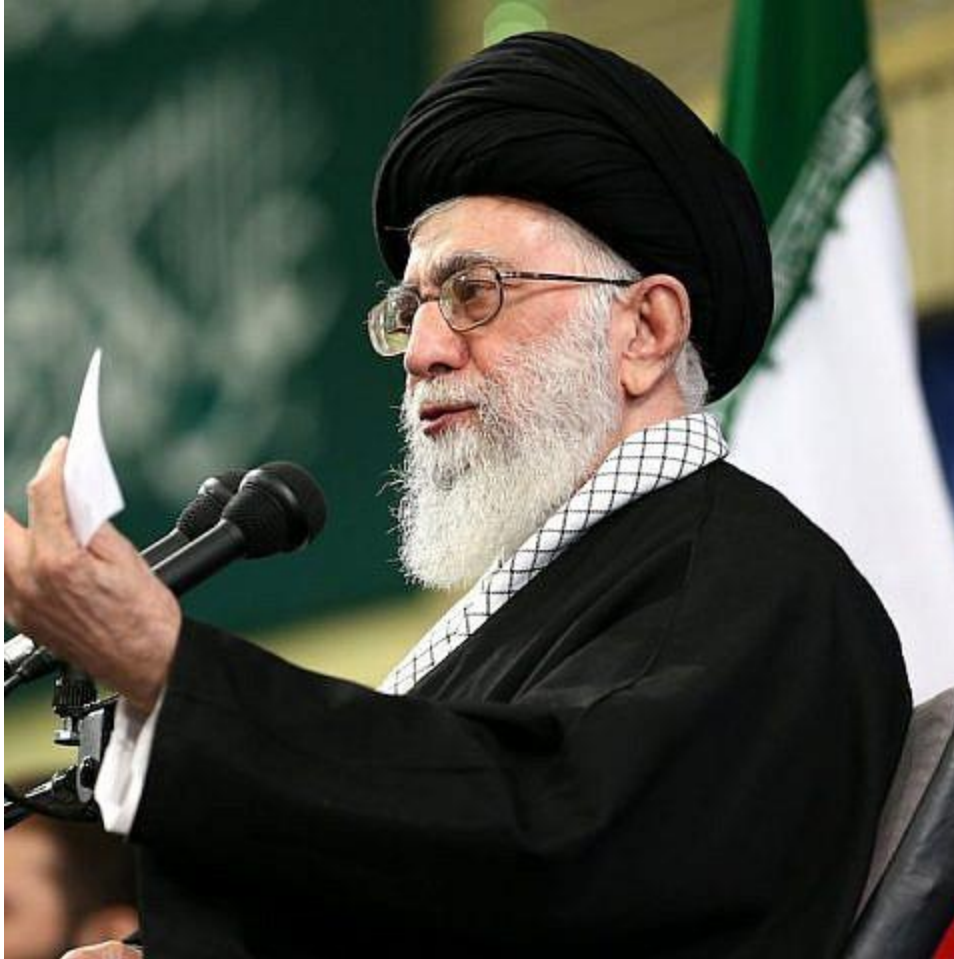
Khamenei pushes back on Israel-Saudi normalization May 2, 2024

The Israeli government is opposed to the establishment of a Palestinian state given Ramallah's support for terrorism. Recent polling shows a majority of Israelis are also against Palestinian statehood.