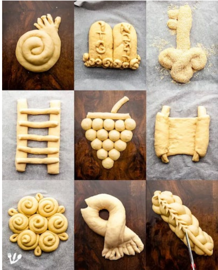
It's not just about Challah, We can be creative with all kinds of foods. I made these one year.