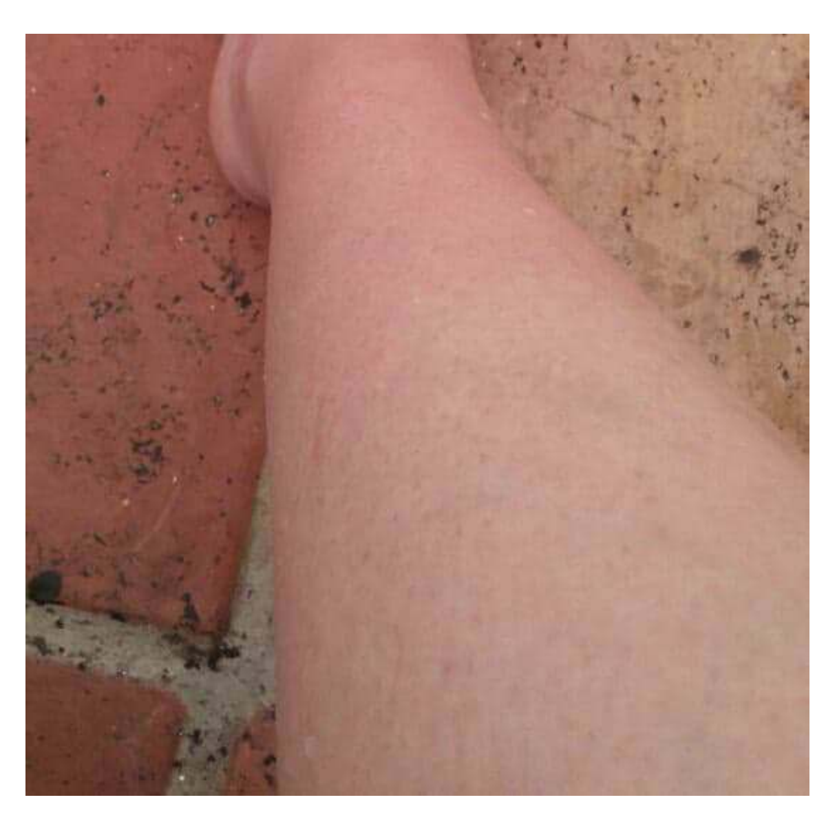
She wrote me and asked me to pray for her daughter. I did and one hour later this was the same foot.