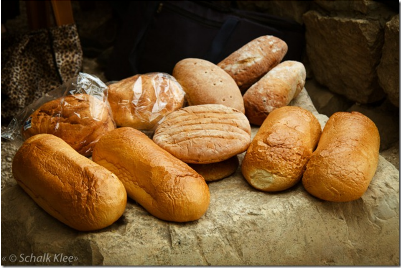
We spent the rest of the day with a very social and peaceful picnic in the Independence Park. We had some nice conversation with like-minded people while the kids ran around and played. What a blessed day we had!