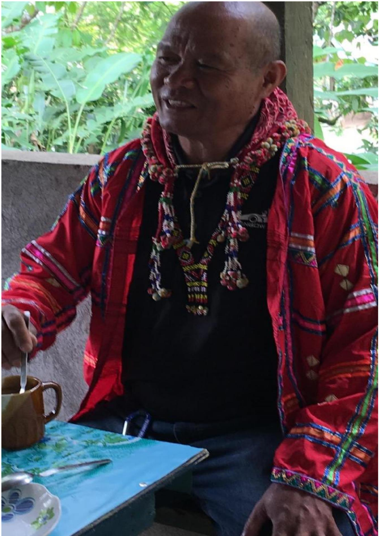
This is the Cheif of this group in his tribal colours. I do not have his name.