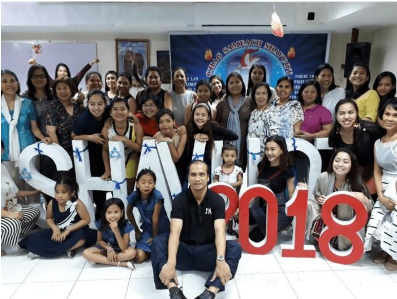
Our women in MLTC.