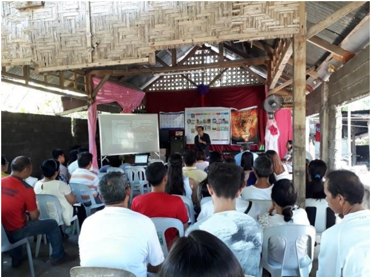
Humble people in Digos city celebrated the feast of Shavuot. Men women and children alike.