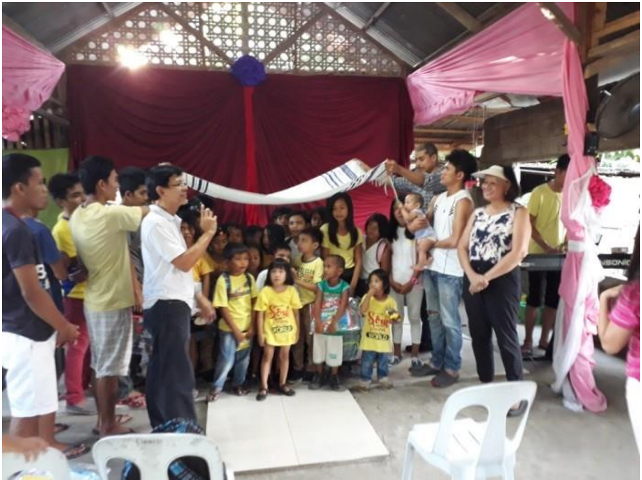
Under the huppah /canopy of the tallit. Children in Digos city. Children are starting to be trained in the Torah.