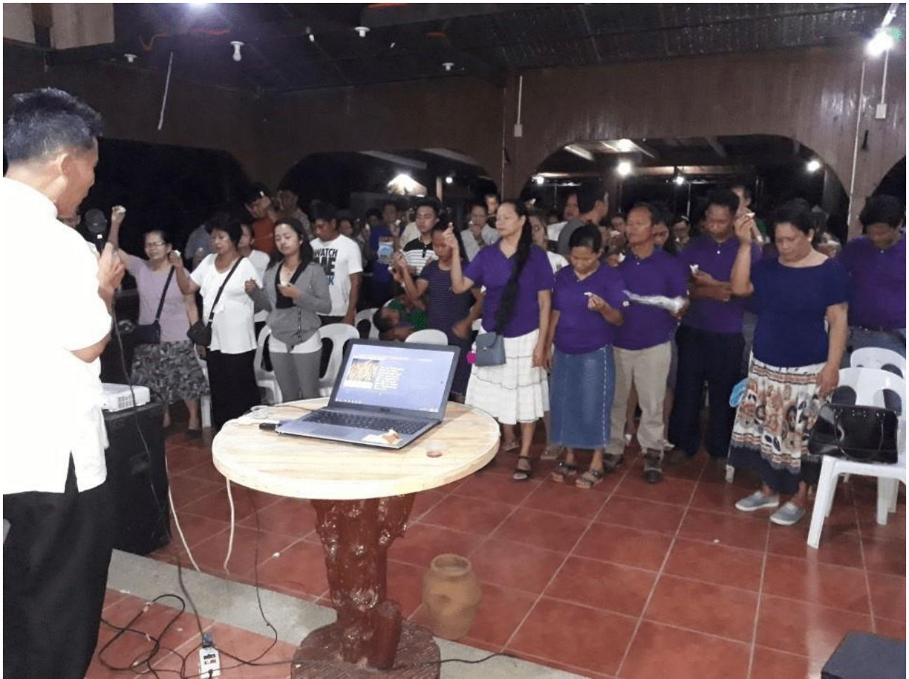
Pentecostal pastors keeping the real feast of Pentecost.