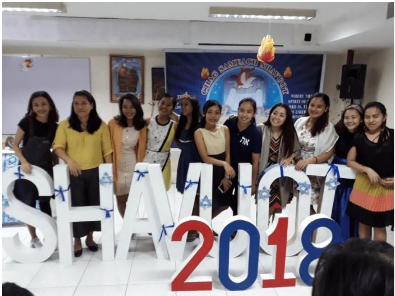
MLTC young single women.