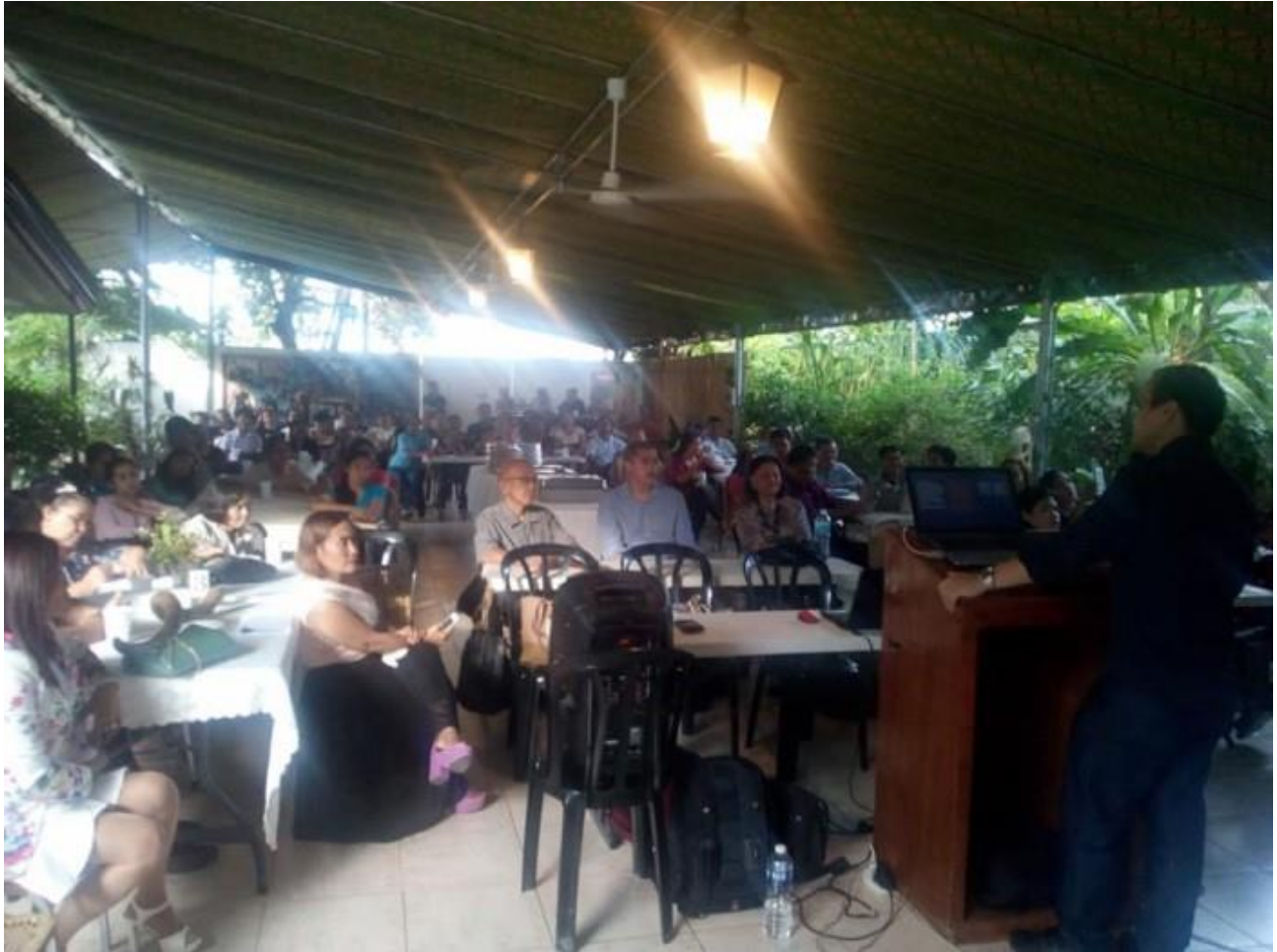
The First ever Feast of Shavuot celebration in Davao city according to the sighted moon.