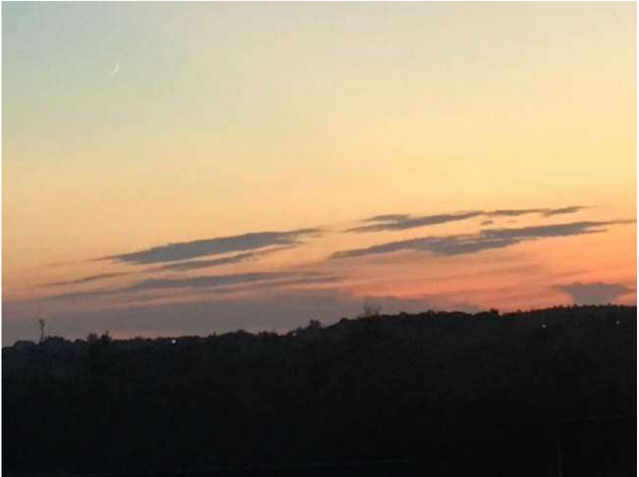
The next is 7:42