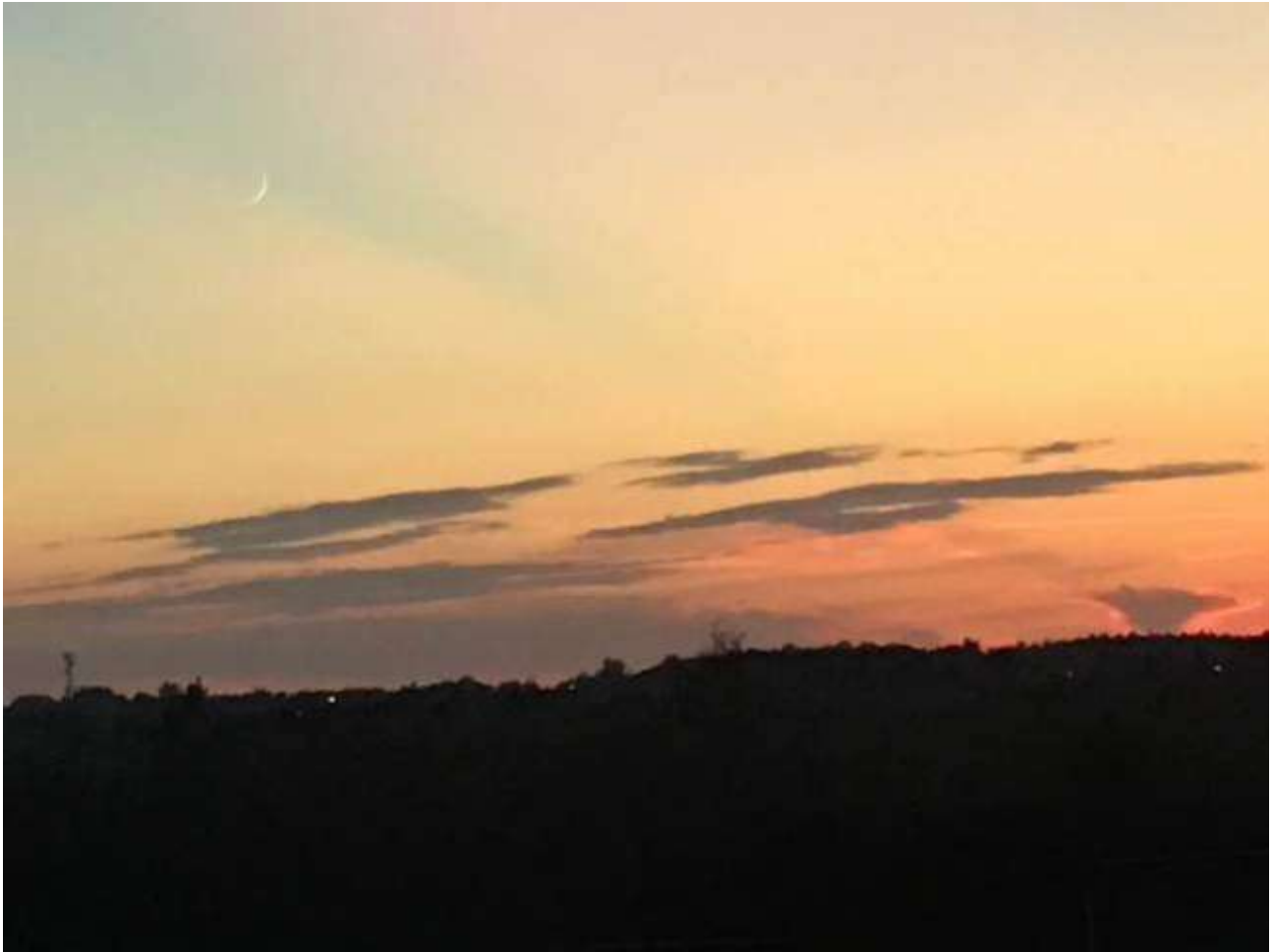
The next one is 7:49