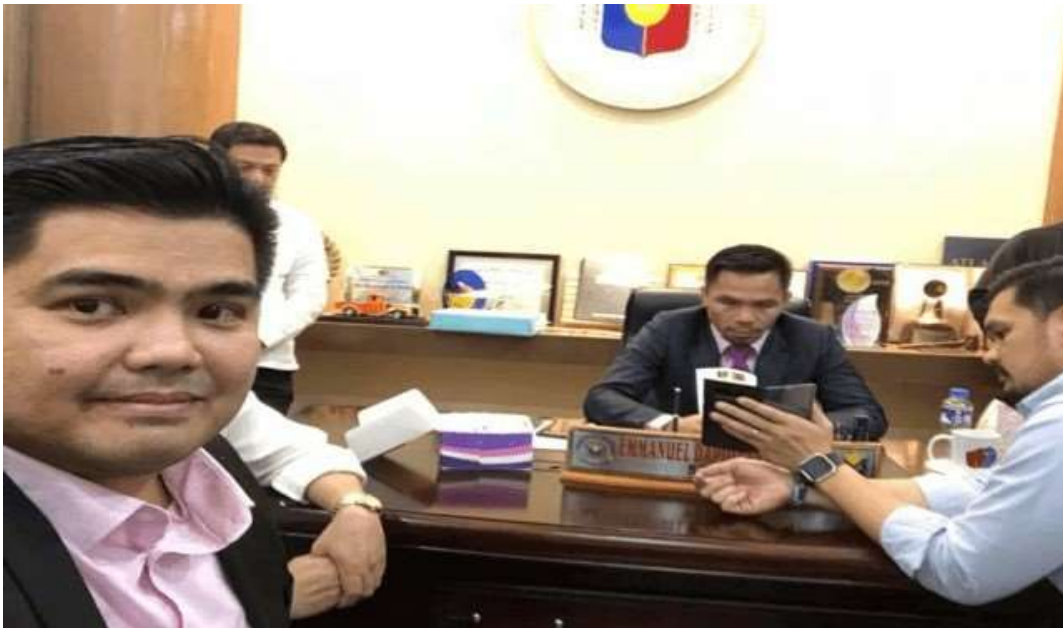
Senator Manny Pacquiao, the 8 times world boxing champion and 8 divisions are now the Belgicas political allies.

Proverbs 28:19 “ without vision the people perish.”