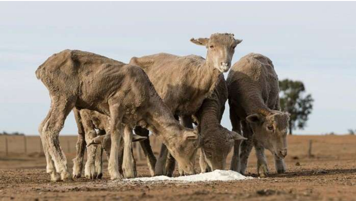
COONABARABRAN, NEW SOUTH WALES – JUNE 20: The Jerry family farm 'Marlborough', 40 km outside Coonabarabran. The New South Wales State government recently approved an emergency drought relief package of A$600m, of which at least A$250m is allocated for low interest loans to assist eligible farm businesses to recover. The package has been welcomed, though in the words of a local farmer "it barely touches the sides". Now with the real prospect of a dry El-Nino weather pattern hitting the state in Spring, the longer term outlook for rain here is dire. June 20, 2018 in Coonabarabran, Australia.

Why is Australia again in the worst drought in 400 years?