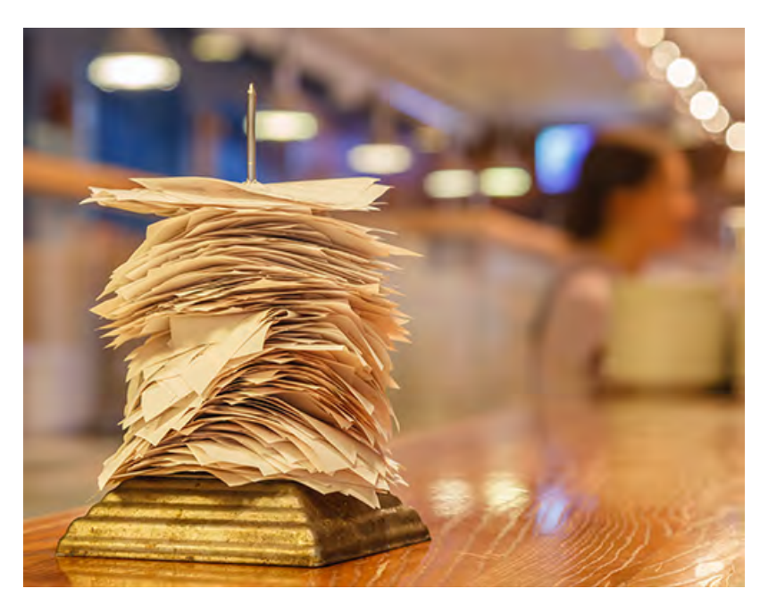
11 "Moreover by them [God's commandments and statutes] your servant is warned, and in keeping them there is great reward." Psalm 19:11

Our note of debt we owed God as a result of our sins is what was "taken out of the way" and "nailed... to the cross." No, it was not The Law itself that was nailed to the cross. The Law is not against us or contrary to us but is a great blessing to us.