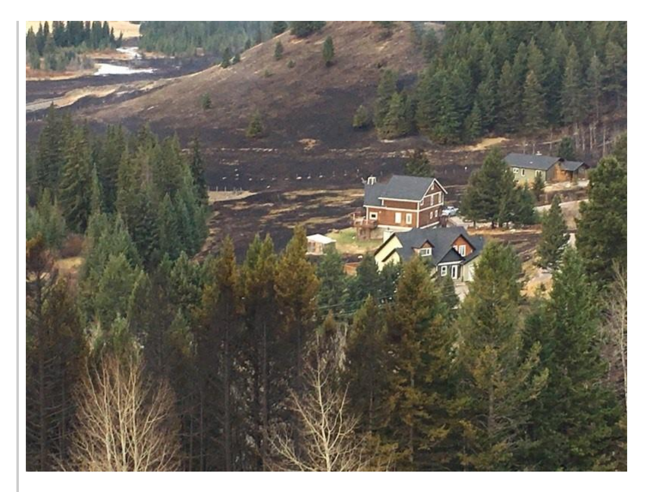
My house from up near the highway