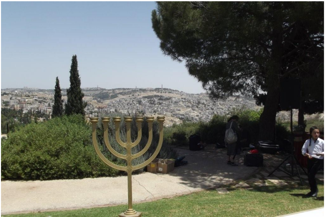
A model of the Menorah