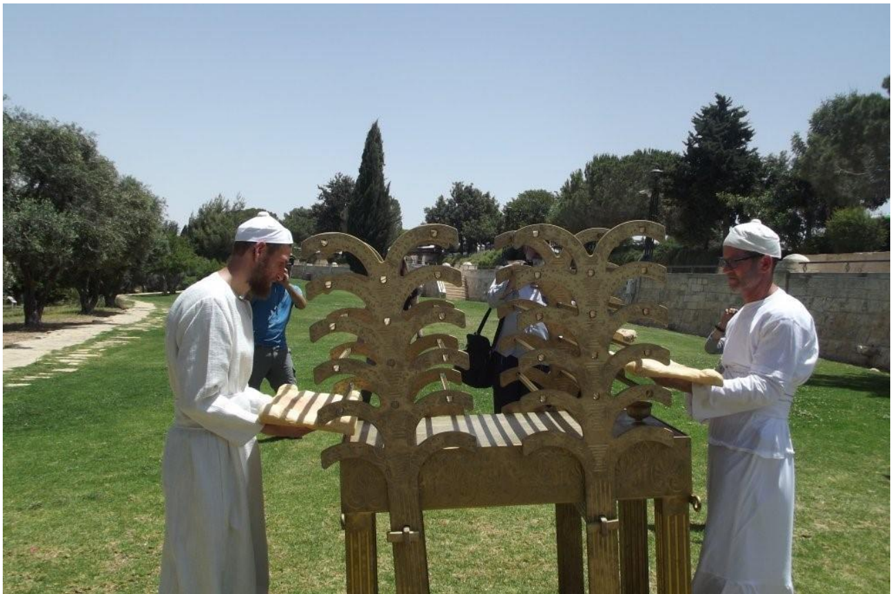
Model rack of show-breads