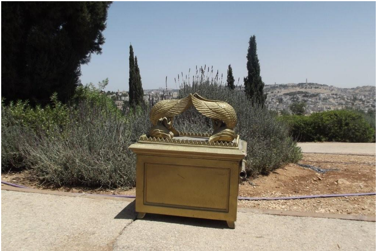
Model of the Ark of the Covenant