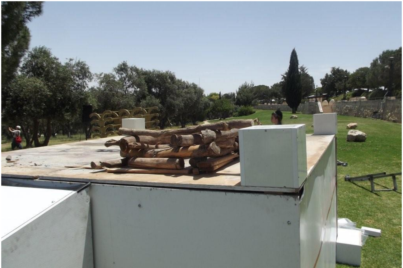
Model of the Temple's Altar