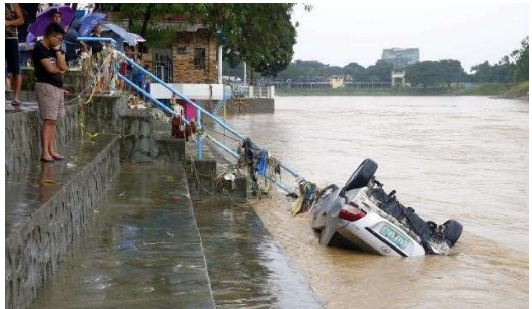
Proverbs 16:18 PRIDE goes before destruction, and a haughty spirit before a fall.