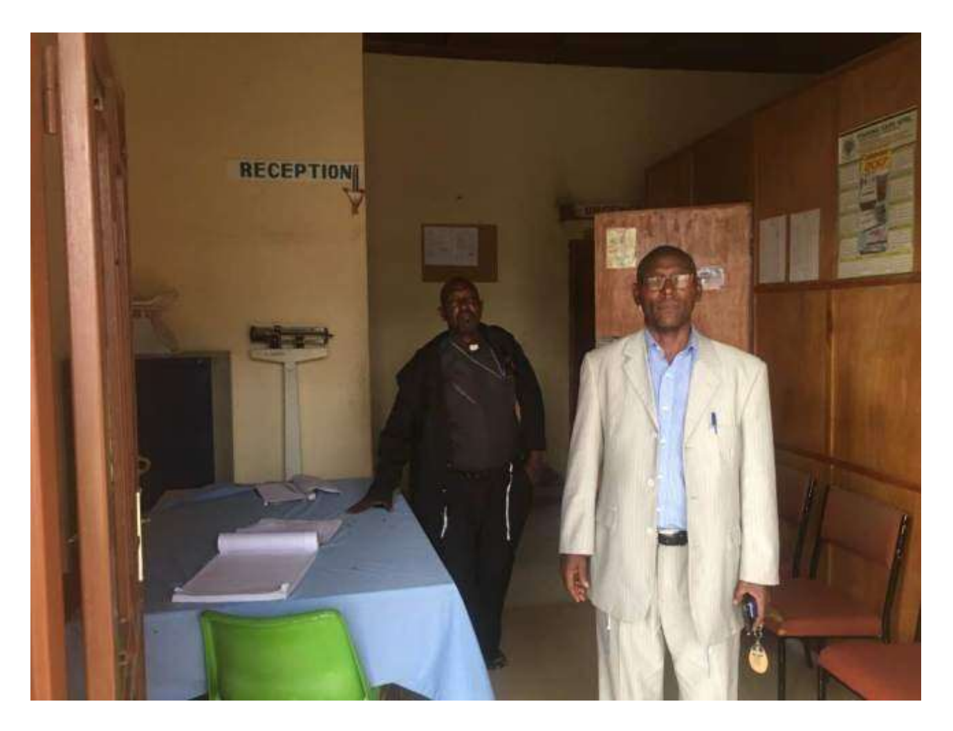
This is the Doctors office or examining room. The Doctor comes by twice a week to check on the patients.