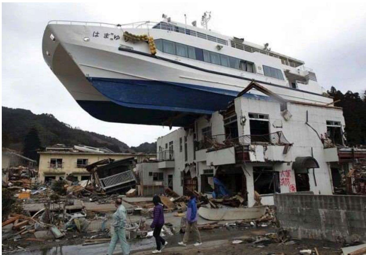
A boat sits atop a building in Otsuchi, Iwate Prefecture, Japan, Tuesday, March 22, 2011, following the March 11 earthquake and tsunami which devastated a vast area of northeastern Pacific coast of Japan.

Below is one picture from the horrific tsunami that hit Japan in 2011 after an earthquake off the coast of Japan.